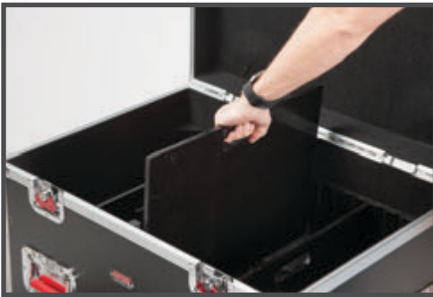
Two Plywood Dividers Compartmentalize the Interior of the Case