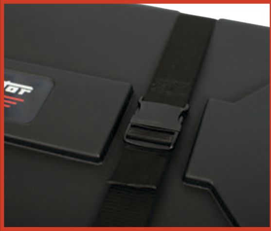
Heavy-Duty Web Straps With Quick Release Buckles Secure the Lid