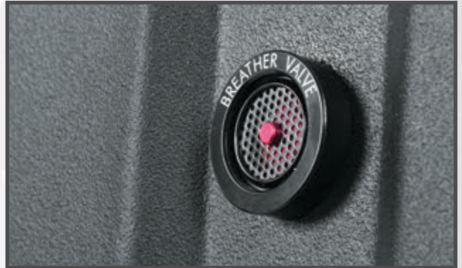
Built-In Pressure Release Valve