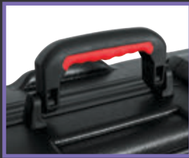
Ergo-Grip Comfort Handle