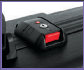
TSA Locking Latches