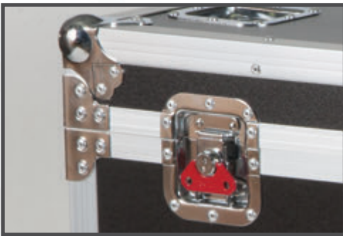
Red Recessed Twist Latches