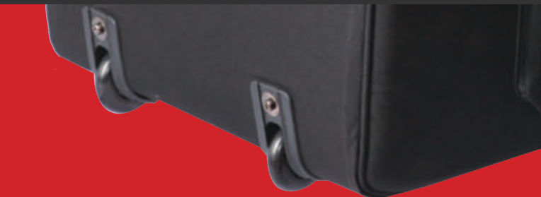
Available With or Without Wheels