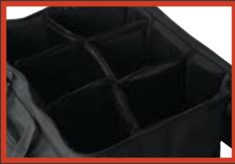
Adjustable Interior Hook and Loop Dividers