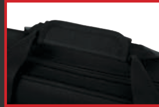
Secure Handle Wrap