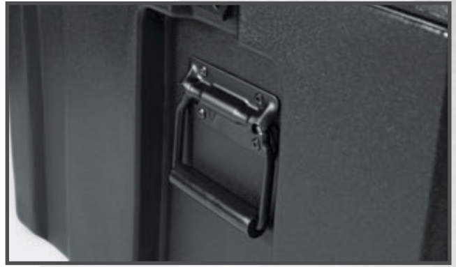
4 Recessed spring loaded handles