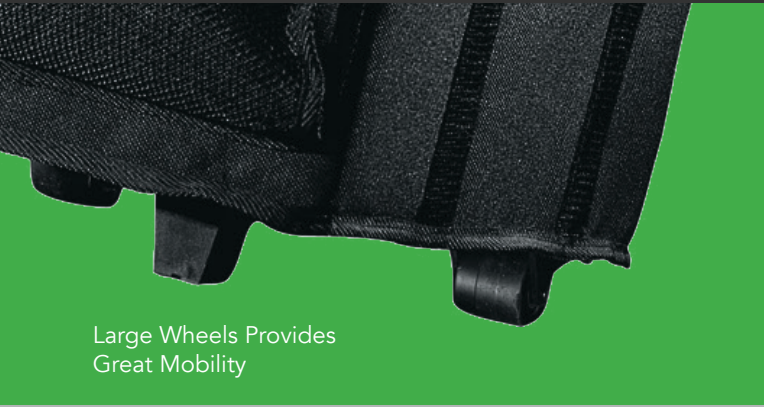
Large Wheels Provides Great Mobility