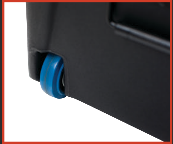
Recessed Commercial Grade Wheels