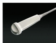
Micro-convex array: C321 (2.5/3.5/5.0MHz)