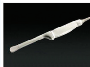
Endovaginal: E613 (5/6.5/8MHz)