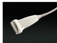
Linear array: L743 (6/8/10MHz)