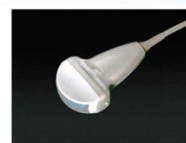
Convex array: C343-1 (2.5/3.5/5.0MHz)