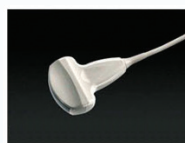
Convex array: C363-1 (2.5/3.5/5.0MHz)