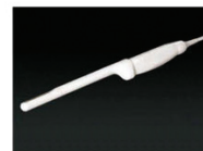
Endorectal: E743 (6/8/10MHz)