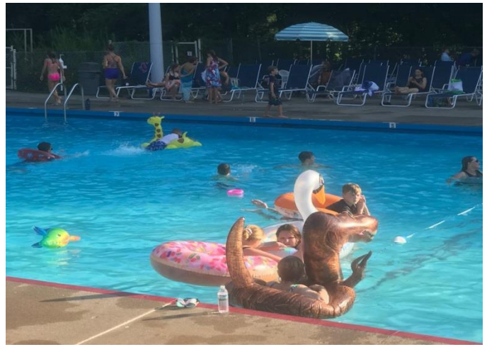
Always Fun at Float Night!

A senior couple membership consists of two adult seniors age 60+ that reside in the same household on a permanent basis. Seniors over the age 70 are entitled to a senior membership rate lock. This type of membership allows guest privileges in accordance with the pool's guest policy.