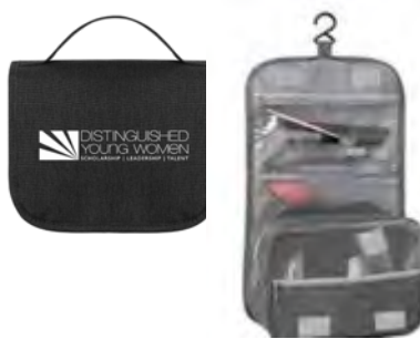
HANGING TRAVEL TOILETRY BAG