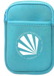
FLORY WATER BOTTLE POUCH - DOUBLE POUCH Attaches to both water bottle and travel mug.