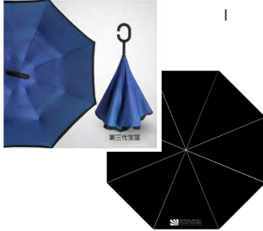
C HANDLE REVERSE UMBRELLA