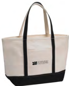
ROCK THE BOAT TOTE BAG