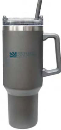
STAINLESS STEEL TRAVEL MUG - 40 OZ.