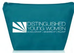
LARGE CANVAS TRAVEL COSMETIC BAG