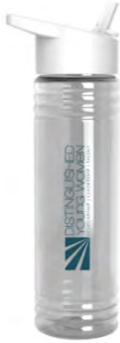
24 OZ. SLIM FIT WATER BOTTLE W/FLIP STRAW LID

Order today for yourself or as a gift and pick up at Registration! Items will also be available for purchase at the Merchandise Table prior to the Shows in the lobby of the Theater!