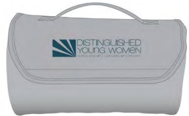
BARREL FLEECE BLANKET