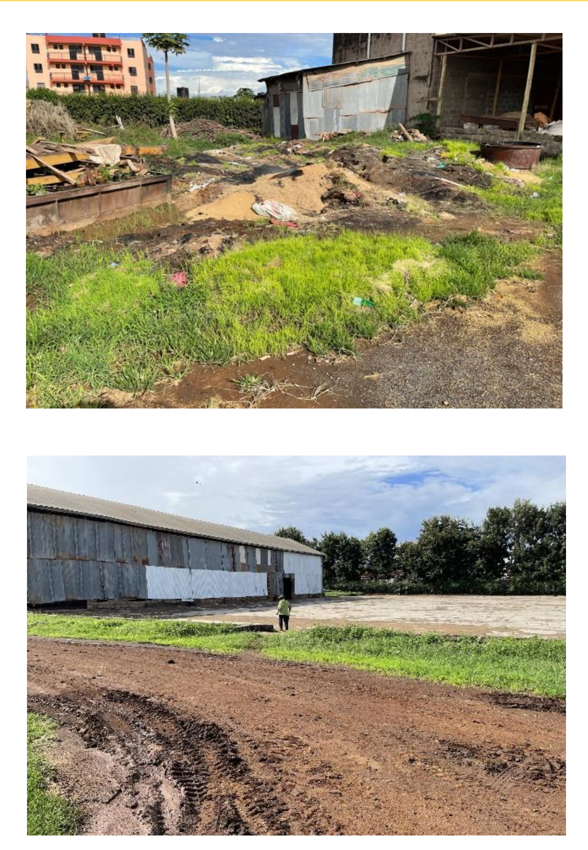
Figure 11: Spilled rice cannot be recovered because of lack of flooring, MRGM premises, Mwea, Kirinyaga