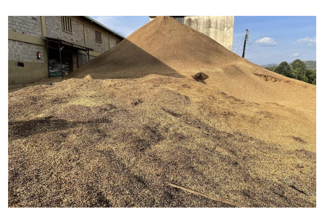
Image 3A: Coffee husks during dry milling at Kipkelion W. Cooperative