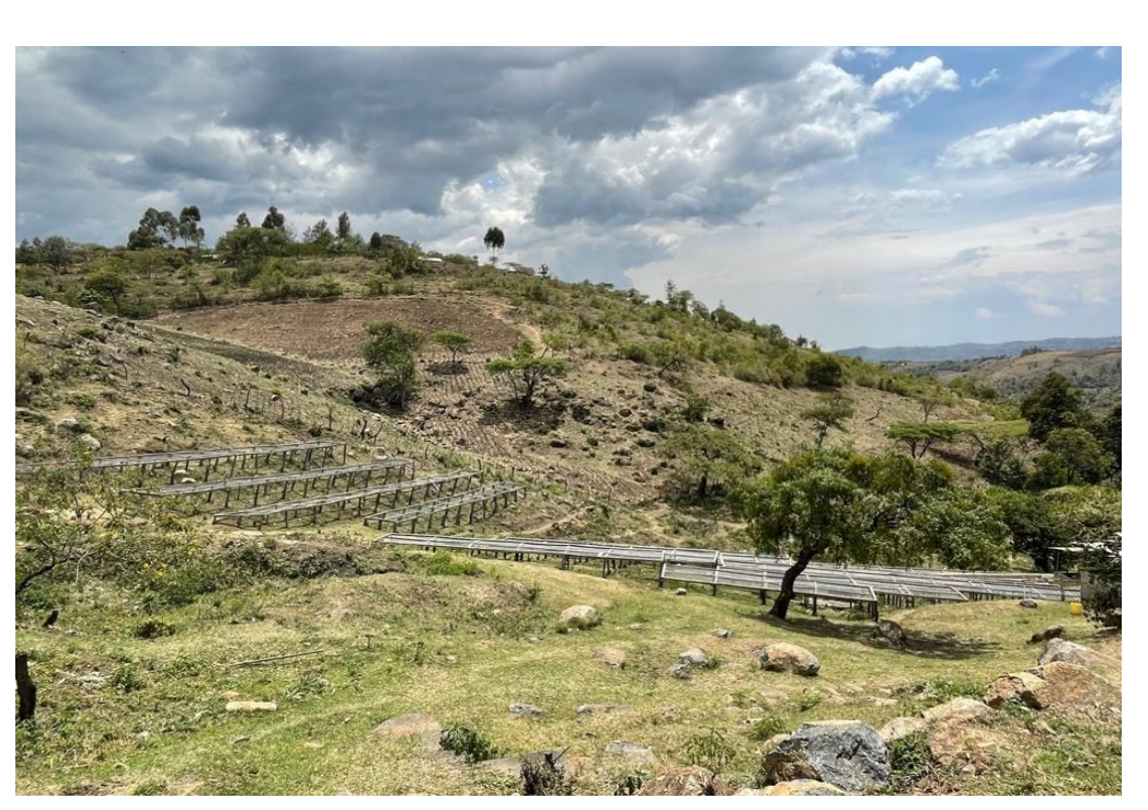
Image 4A: Rows of wooden dryers for naturally drying coffee parchment