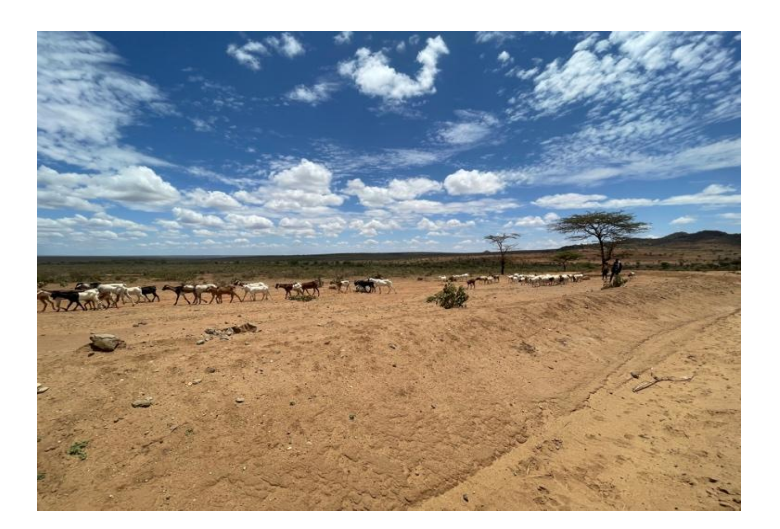
Image 18A: Livestock is a bigger hazard than climate change and wildlife to soil erosion because of overgrazing. Bare soils increase runoff from rainfall making deep gullies, leading to even more runoff