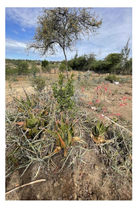
Figure 19: Image showing natural biodiversity in arid regions: aloe vera plants, acacia tree and cacti.