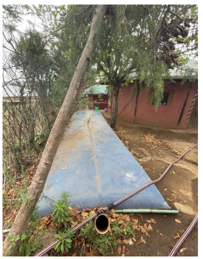
Image 20D: Biogas flex tube trialling use of opuntia pads mixed with cow dung for biogas generation