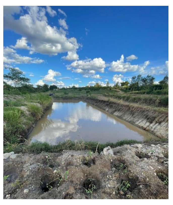
Image 15B: Example of a pond dug by NIA in a farmer's field Figure 15: Examples of storage solutions for water