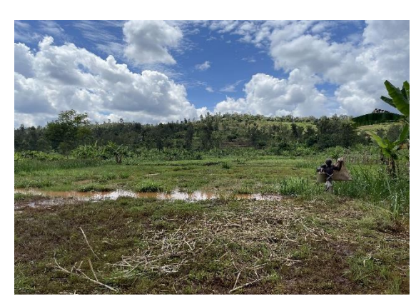
Figure 22: Farmers have canals to drain water into the river, but this measure is not sufficient. Flooding still occurs during long rains and destroys crops.

Farmers own land along the slopes, and lease land in the valley below where there is surplus water, making vegetable production suitable. During long rain seasons, March – May, heavy flooding occurs. Farmers have made canals to drain water into the river, but this measure is not sufficient as flooding still occurs and can sometimes destroy crops. When flooding occurs, farmers move their farming up the hills as a coping measure. Rainwater harvesting specialists could advise on how flooding could be converted from a risk into an asset, by collecting and redirecting water into appropriate storage tanks and nearby surface water bodies. Water harvesting measures like this could be combined with solar water pumps to help redistribute water from storage tanks instead of using them for extracting water from rivers or groundwater sources.