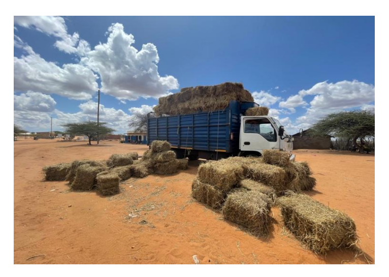
Image 18C: Pastoralists are adopting coping strategies such as buying hay from neighbouring counties like Meru. At the time of this site visit, April 2022, there had been no rainfall in 8 months. 1 bale of hay costs 280 KSH. 1 bale feeds 3 cows, this is only used as survival supplement and is not full diet.

Figure 18: Overgrazing, deforestation and soil erosion in ASAL, Kenya