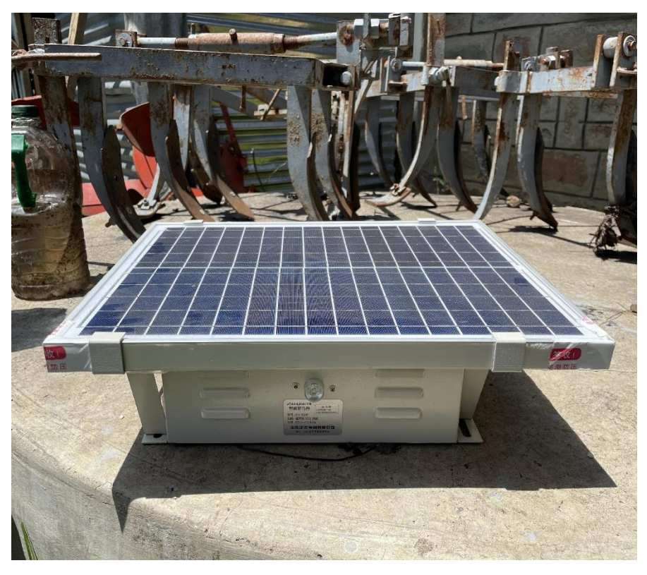
Image 8B: Solar powered bird scaring machine, Bird Pro imported from China. Price: 40000 KSH (~400 USD) inclusive of import duties and taxes.

Figure 8: Use of technology in managing quelea birds. Location Nyabon Enterprises, Kisumu County