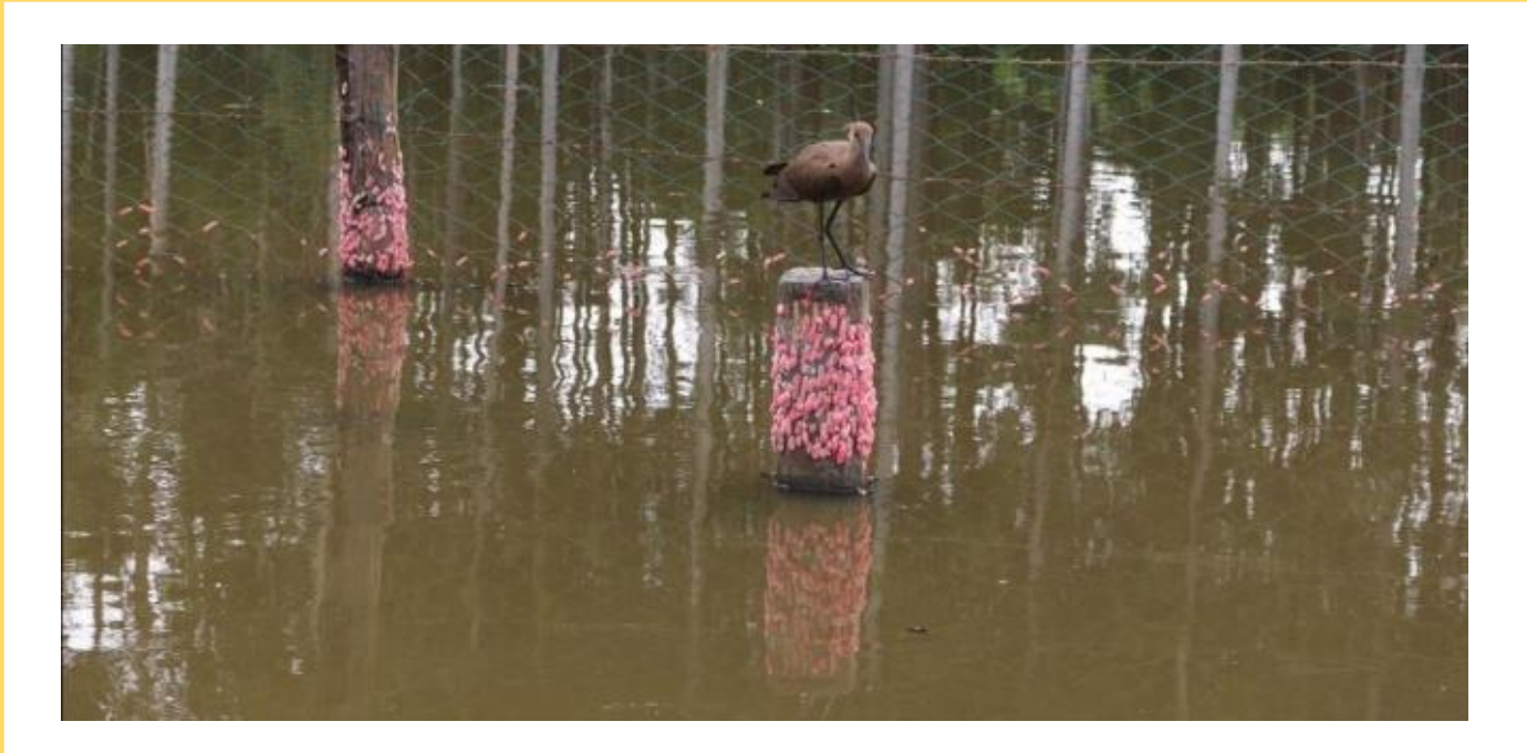
Figure 7: Apple snail eggs (pink) in Mwea, Kirinyaga county.

While there is no direct link between access to solar technologies and this pest, an indirect link does exist. To ensure farmer resilience and de-risk solar payments in rice value chains, capacity building farmers to use ecological principles in management of snails (as opposed to use of synthetic 'instant kill' molluscicides) is key, as well as ensuring effective draining to prevent puddles forming in the first places.