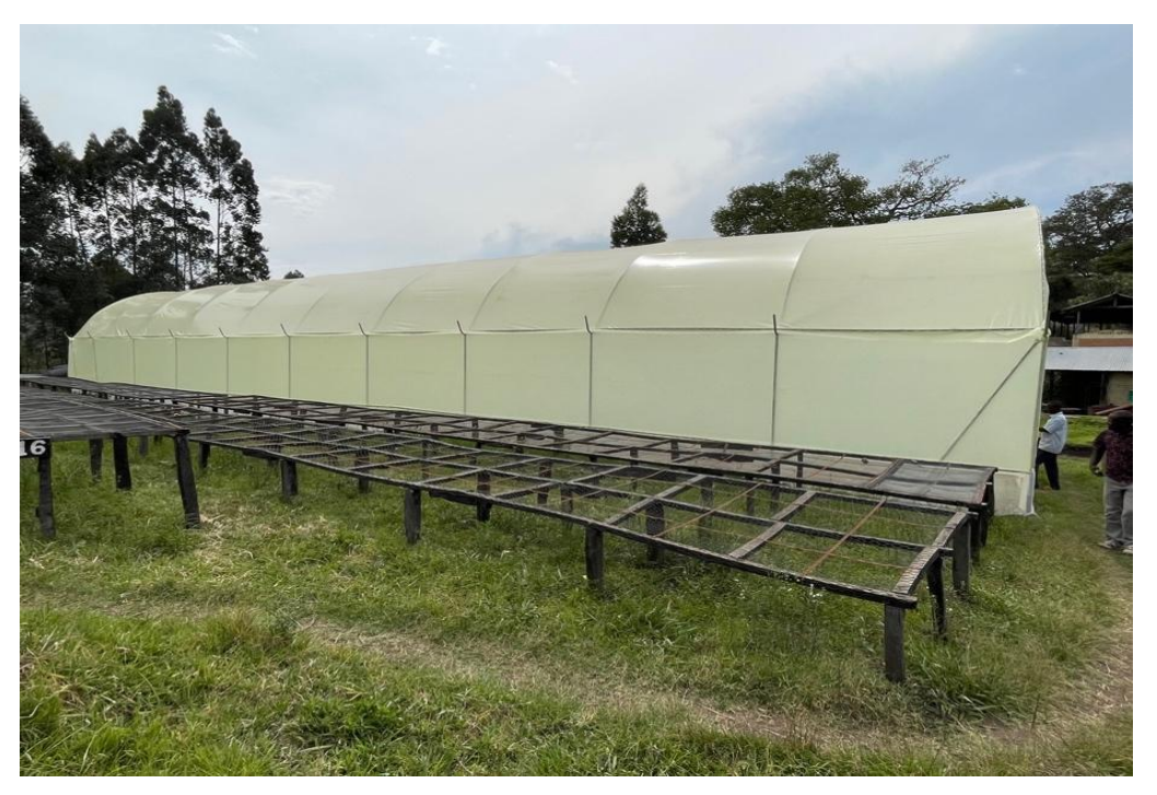
Image 4B: Solar tunnel dryer alongside wooden dryers with rusted wire mesh

Figure 4: Coffee parchment drying in Kericho County