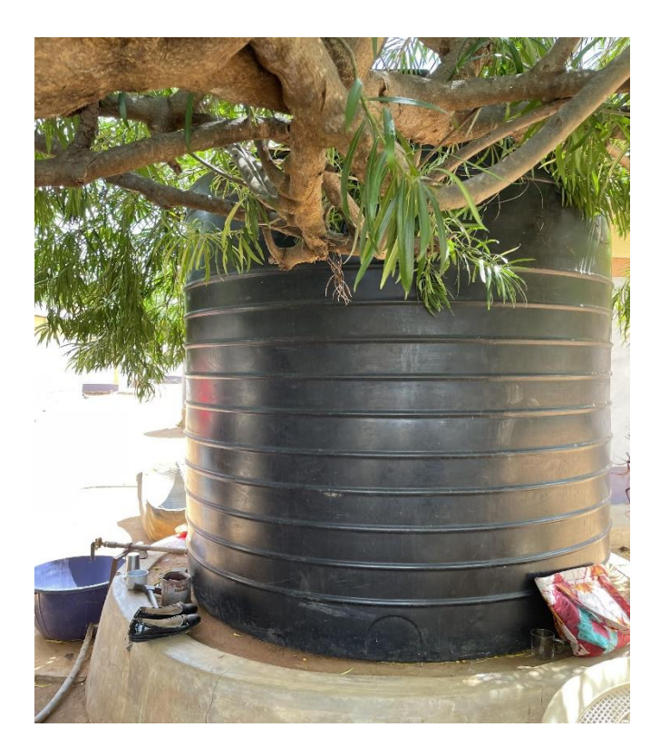
Image 15A: Example of a tank installed under tree shade to help improve life of the storage tank