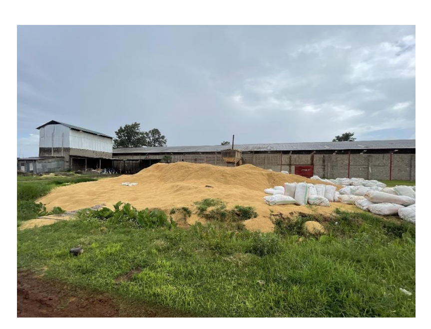
Image 6A: Rice husk hill as a by-product from milling at Mwea Rice Growers Multipurpose Coop