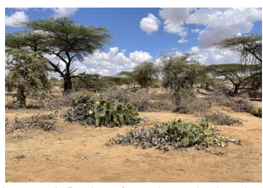
Image 20A: Patches of opuntia growing invasively across Laikipia communal grasslands