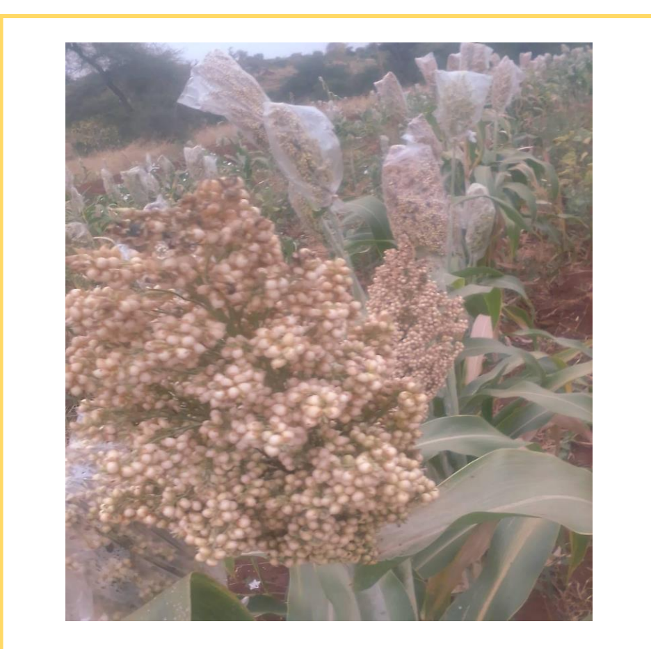
Figure 13: Coping strategy by farmers of covering millets/grains with plastic as a protective mechanism against bird predators. This image shows a sorghum crop. Farmers are known to use a similar practice for maize.

Birds are one of the key threats to any cereal crop. There are examples of farmers who have resorted to using plastic covers on maize crops as a protective measure against birds, which increases aflatoxin build-up<sup>49</sup> in the seeds. See image in Figure 13.