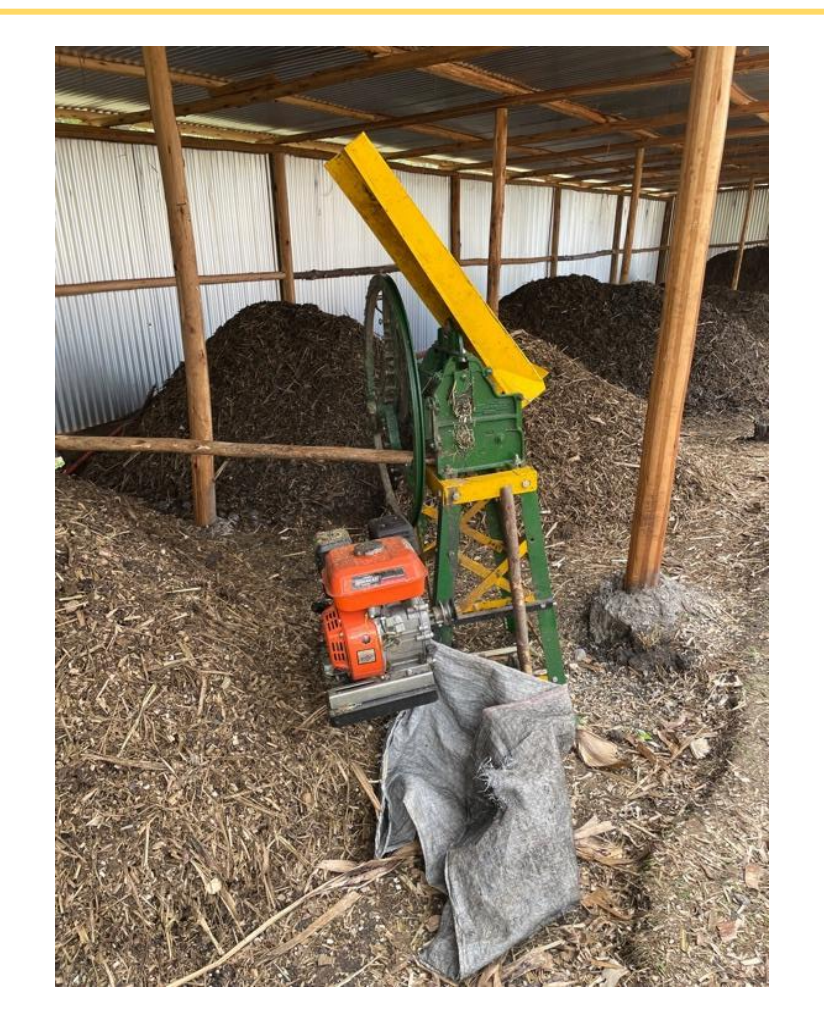
Figure 5: Image of a fossil fuel-based chaff cutter being deployed for aggregated compost making, Kericho county

3. Community TV for the youth and others alike: This could help bring the community together and enable a space for sharing ideas. Loads like TVs can be powered by the excess power generated from water pumping sets when they are not in use. TV watching over an organised schedule could attract people to the community space and encourage interest in the interaction between solar technologies and regenerative agriculture.