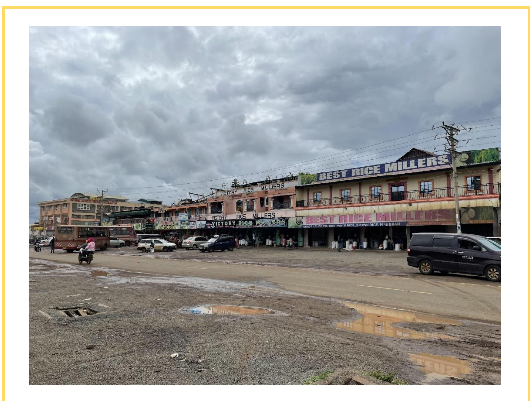
Figure 9: Mwea town area dotted with private rice millers, Kirinyaga county

Overview of rice mills in Kenya: The findings of the study on rice milling in Kenya, undertaken by the Jomo Kenyatta University of Agriculture and Technology and Ministry of Agriculture, Livestock, Fisheries and Irrigation, Kenya, year 2019 indicate that there are about 16 medium and large mills with a total installed capacity of 66 tonnes/hour across the mills. 256 small-scale millers were also identified, with an estimated capacity of 128 tonnes/hour.<sup>43</sup> These electric mills are powered using the utility grid or diesel. There is potential to explore retrofitting these rice mills with solar power.