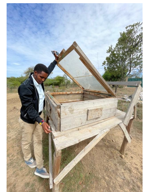
Figure 17: Image of an early prototype of a DIY solar dryer

Solar dryers for fruit: If every farmer had access to solar dryers, they could dry fruit for self-consumption and sale instead of throwing away fruit. Cold storage solutions will not completely eliminate food waste. Drying technologies can serve as an important complementary solution that can also help with farmer nutritional security. Any intervention aimed at enhancing uptake of drying technologies for self-consumption of fruit needs to be combined with an intervention aimed at raising awareness on nutrition and importance of diet diversity. Farmers can be upskilled to build do-ityourself small-scale solar dryers, see Figure 17.