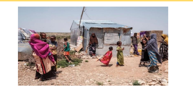
Figure 1: People in informal settlement of internally displaced people in Somaliland. Image from <u>https://time.com/6110836/african-climate-migration-world-bank/</u>

In Kenya, tens of thousands of hectares of farmlands have become so degraded that they no longer produce adequate or regular crops or pasture for livestock. Reduced precipitation and climate variability will mean that farmers will be able to practice less and less rainfed agriculture. It is projected that by 2050, as many as 38.5 million people in East Africa will be internally displaced due to climate issues<sup>23</sup>. This displacement will add stress to humanitarian settings which are already overwhelmed. Regenerative agriculture practices have the potential to reduce displacement by making the farmlands more productive. In the energy access sector, enabling access to clean energy in humanitarian settings is an emerging area of focus, and regenerative agriculture can help provide some relief both to reduce climate-linked displacement and to provide livelihood support in humanitarian settings.