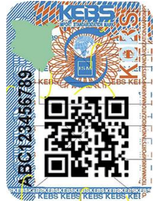
Kenya Bureau of Standards import standardisation mark