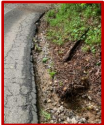
Ex: Before ↑