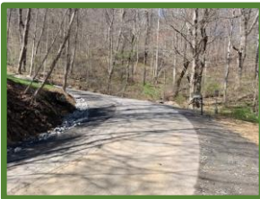
Ex: After ↓