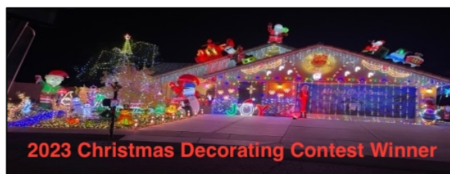
2023 Christmas Decorating Contest Winner

As always, your annual assessments must be paid in full and you cannot have any violations pending.