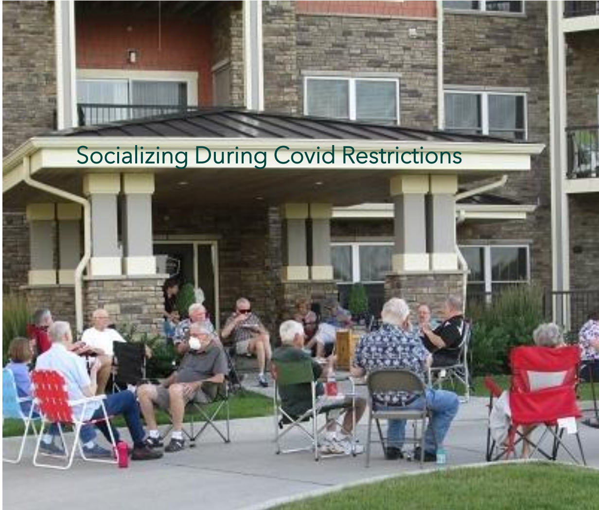
Socializing During Covid Restrictions