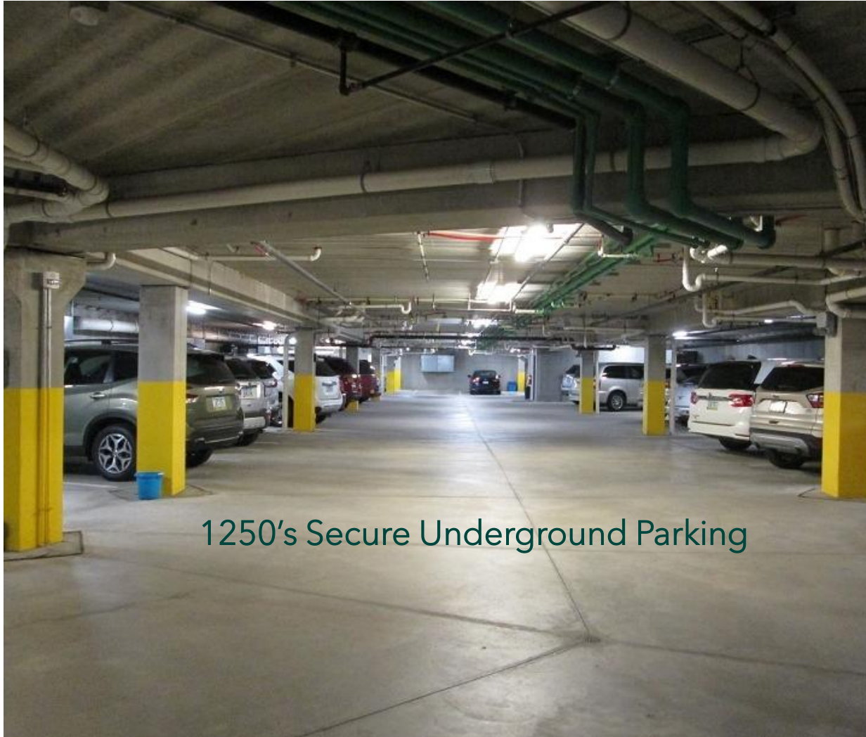
1250's Secure Underground Parking