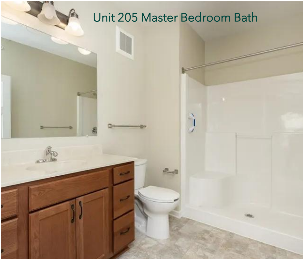
Unit 205 Master Bedroom Bath