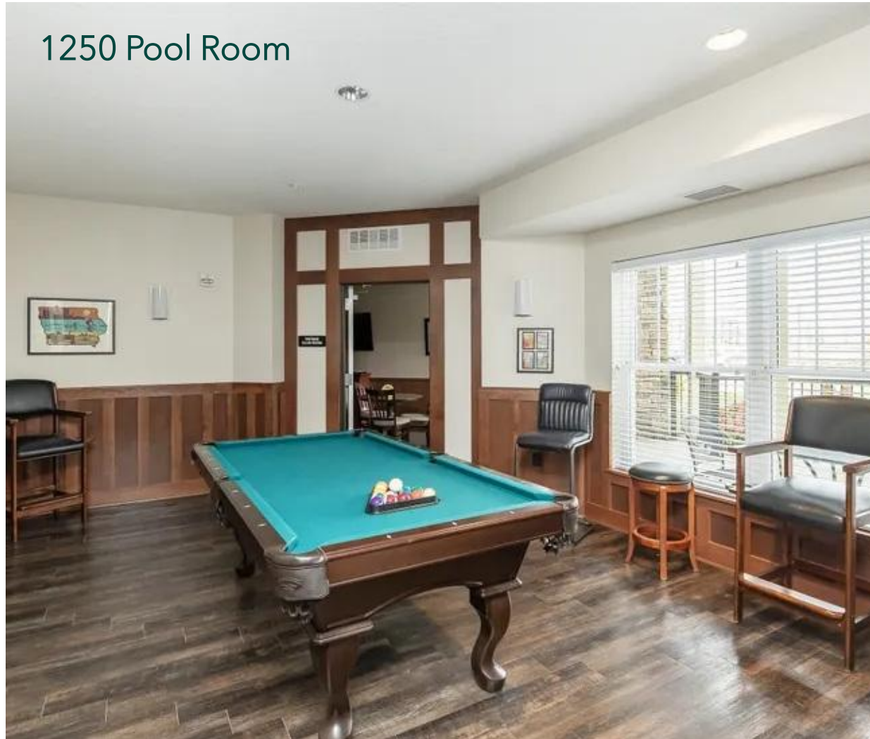
1250 Pool Room