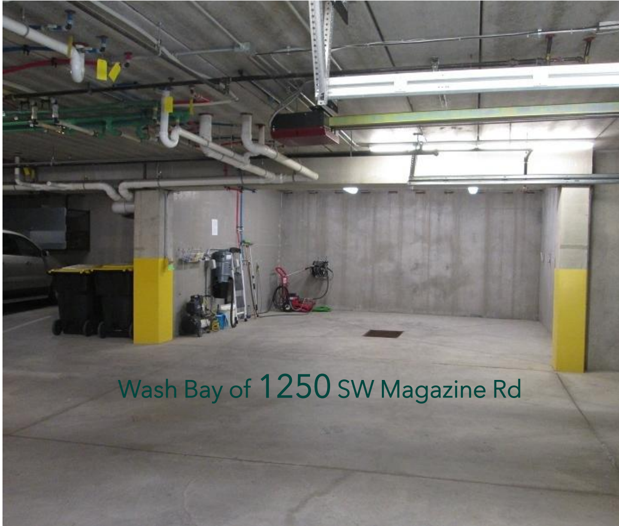
Wash Bay of 1250 SW Magazine Rd