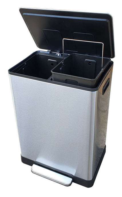
Optional: Add-on Recycling Label