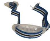
Elastic Chin strap w Chin cup