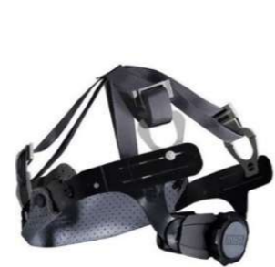
MSA Ratchet inner lining