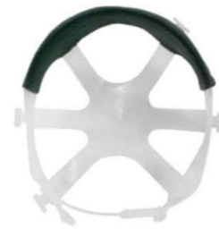
Helmet inner lining