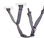
MSA 4 point helmet Chin strap