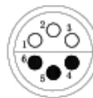
6 ( \phi 0.7 )