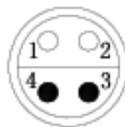
4 ( \phi 0.9 )