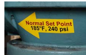
Cut-out shapes and text with the BBP37 printer (Requires 4 in. wide material. Cut-out text must be 0.75 in. or larger.)