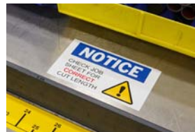
Multi-color printing in a single print pass

B30-series label rolls ..... page 36 B30-series print ribbons ..... page 74