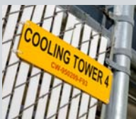
Safety and industrial signage