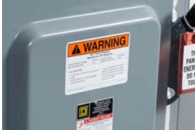
Arc Flash Labels