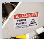
Safety and compliance labels