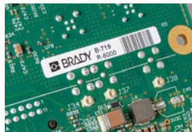
Electronics and PC boards