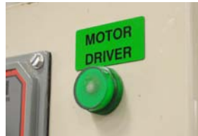
Raised Panel Labels