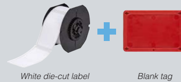
White die-cut label