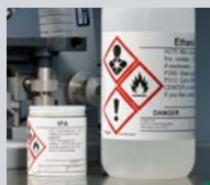
GHS hazcomm labels