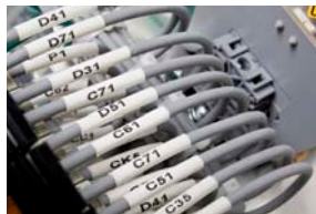
Wire and cable markers