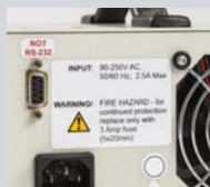
Product ID labels