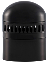
Acoustic warning device.