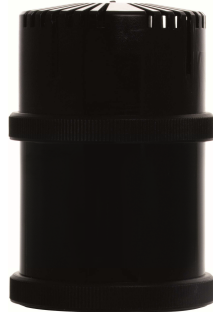
Acoustic warning device