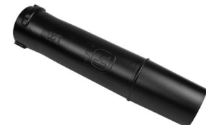
LOWER TUBE 504 06 46-01