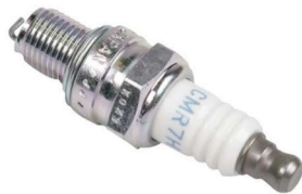
SPARK PLUG 521 23 34-01