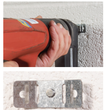
Suitable for direct to surface fitting

Safe-D F-Clip 30 is a fire-rated flexible cable clip that is supplied in flat form, and can be quickly folded to make a variety of shapes to most effectively secure cable installations.