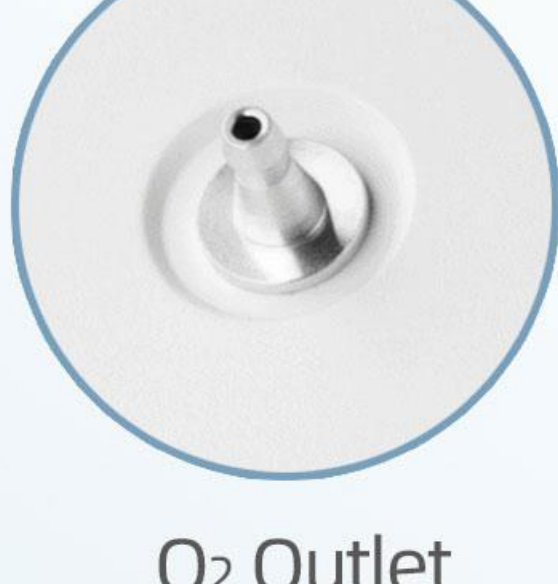
O 2 Outlet