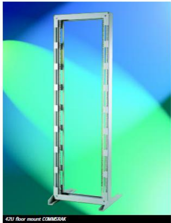
42U floor mount COMMSRAK