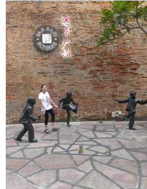
Far East Square