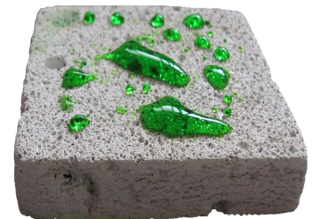
POROUS SURFACE TREATED WITH W4

Stone is sensitive, test apply on a small area, to check on the changes in shade. Before full application.