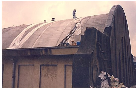
MALAYAN RAILWAY 1998