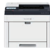
DocuPrint CP315 dw