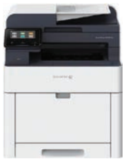
DocuPrint CM315 z