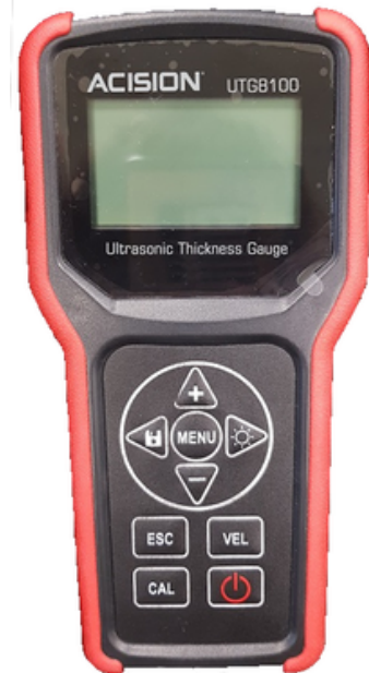
Acision UTG8100 Ultrasonic Thickness Gauge