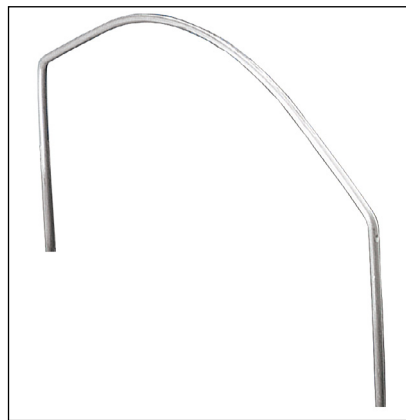
Stainless Steel Wire Divider

Meets EN 61340-5-1 and Packaging Standard IEC 61340-5-3 per IEC 61340-2-3