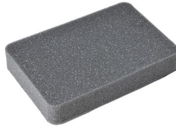
1022 Pick N Pluck™ Foam Insert