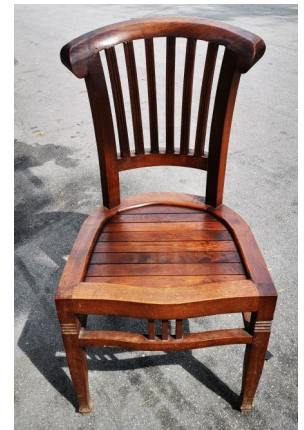
T300 coated to prevent mold growth.

Disclaimer: The information provided in this brochure is ensured to be as accurate as possible at the time of inclusion, however there may be inadvertent and occasional errors which may have slipped from our notice. Warrior Pte Ltd does not guarantee and make no representations or warranties of any kind about the information, advice and opinions provided and reserves the right to make changes and corrections at any time, without prior notice to any parties. Warrior Pte Ltd accepts no liability for any inaccuracies or omissions in its brochure and any decisions made based on information and opinions contained in the brochure is the sole responsibility of the user