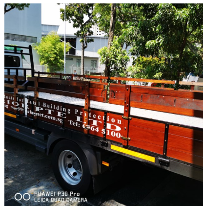
Truck Bed coated with T300 to resist rain damages and mold.