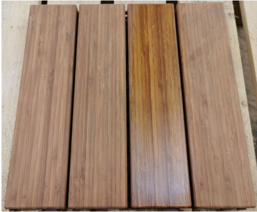
Wood grain is enhanced after oiling with cloth.