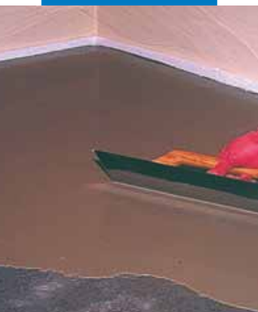
Applying Novoplan 21 with a metal trowel on a cementitious screed primed with Primer G