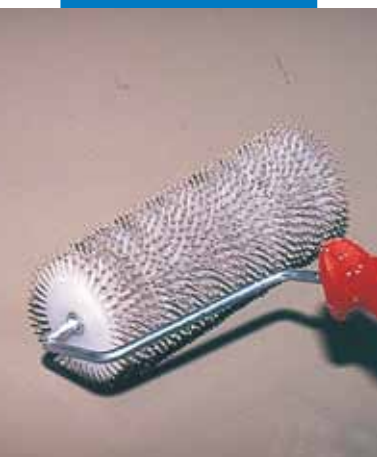
Using a spiked roller over a fresh coat of Novoplan 21