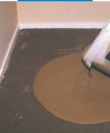
Applying the Novoplan 21 paste on the substrate