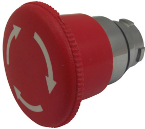
RB2 - BS54