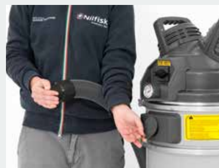
PullClean filter cleaning system: close the inlet and pull the flap rapidly and several times