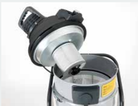
Star filter and absolute filter