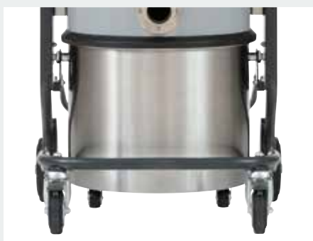
Stainless steel 37L container