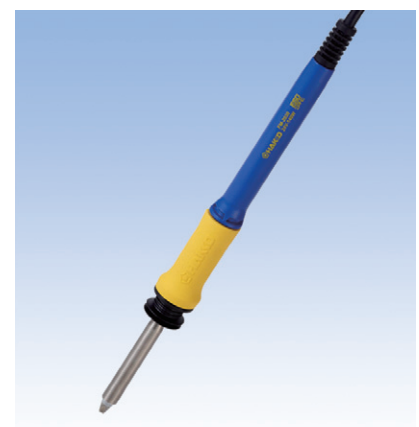
Heavy Duty Soldering Iron