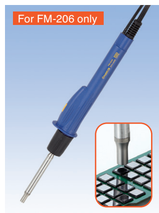
Hot Air Rework Pencil