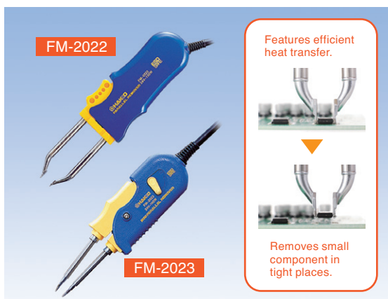
SMD Hot Tweezers