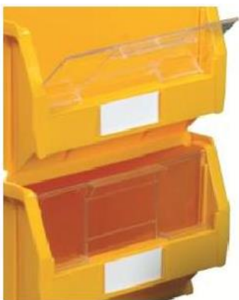
The Clear Front cover – stock no. 456-3432 fits the SIZE 7 bin