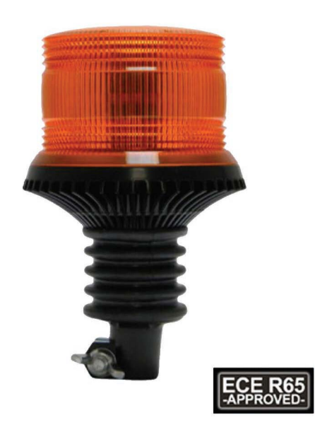
*Double Flash only on RS 907-6047

The brand new RS LED R65 Beacon range features a robust polycarbonate fresnel lens and 12 x 3W High Performance LEDs. Perfect for automotive or industrial use.