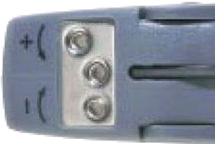
Detail of blade depth adjustment keys in bottom of stripping jaw.