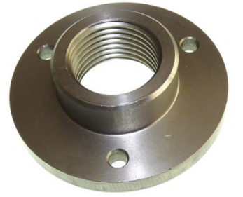
RS part 381-7233 with 1/2" BSPP thread