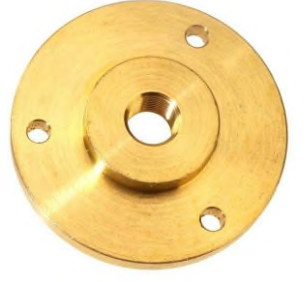
RS part 286-816 with 1/8" BSPP thread

Brass or Stainless steel flange plates for mounting/installing temperature probes