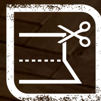
CUT & FOLD