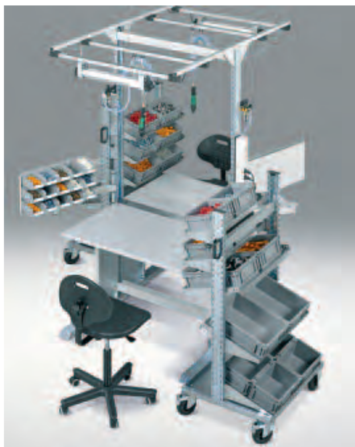
Example of use of the LB Unimod series trolleys

■ The B103 series trolleys are supplied with 2 stiffening bars