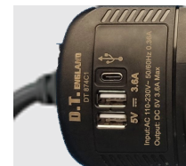
Strong moulded cable gland to prevent cable break off