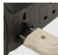
Direct 2-Pin Plug in