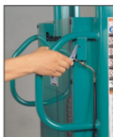
Easy Lowering by pulling lever Deadman design for safety (Manually Operated Models)