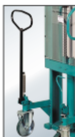
Flexible Moving Handle Capacity of over 650kg Comes standard