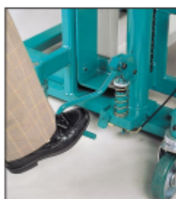
Easy Lifting by pumping pedal Pedal can be folded (Manually Operated Models)