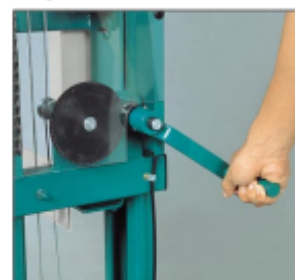
Quick Lifting Device (Manually Operated Models) When placing an order, please be sure to write "Fast-uplifting device (H)"