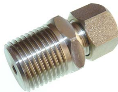
(BSPT tapered example – 286-787, see below for other sizes)