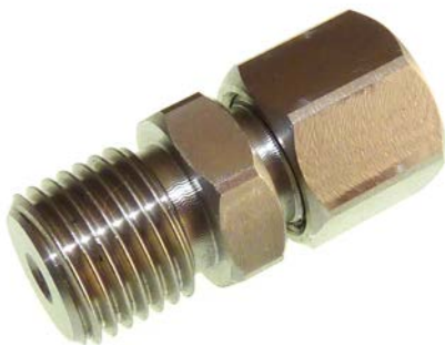
(BSP parallel example - 381-7362, see below for other sizes)