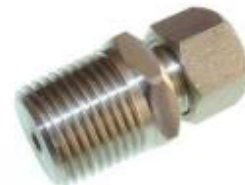
(BSP parallel example - 381-7362, see below for other sizes)