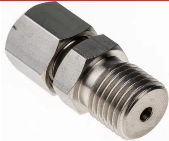
(BSP, BSPT, M8, M16 & M20)