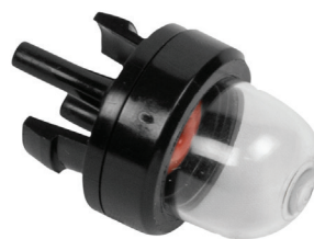
PURGE BUBBLE 503 93 66-01