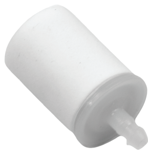
FUEL FILTER FOR MOST OF OUR 574 44 45-02 HANDHELD PRODUCTS 503 44 32-01