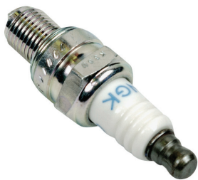
SPARK PLUG NGK CMR6H 531 00 86-15