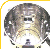
6S: Heavy duty stainless steel

Powerful 2600W and 3300W maximum suction strength with 2 x 1300W or 3 x 1100W individually switchable motors and 2-stage fans giving maximum air flow of 435 m 3 /h and 645 m 3 /h for high productivity. Bypass cooling protection prolongs motor operating life for long usage.