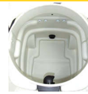
7P: Heavy duty polypropylene, chemical resistant

High capacity 89-107 (gross) / 67-74 (nett) litres, highly durable tanks, allow for large amounts of liquids and materials to be continuously collected on the job.