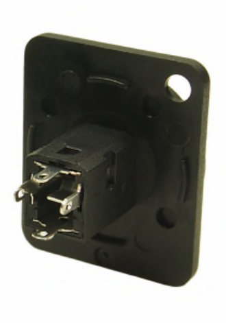
Plate mounted with 6.35mm Vertical Stereo Jack Socket, PC Mount.