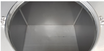
Air-tight/ Leak-proof/ Weather-proof