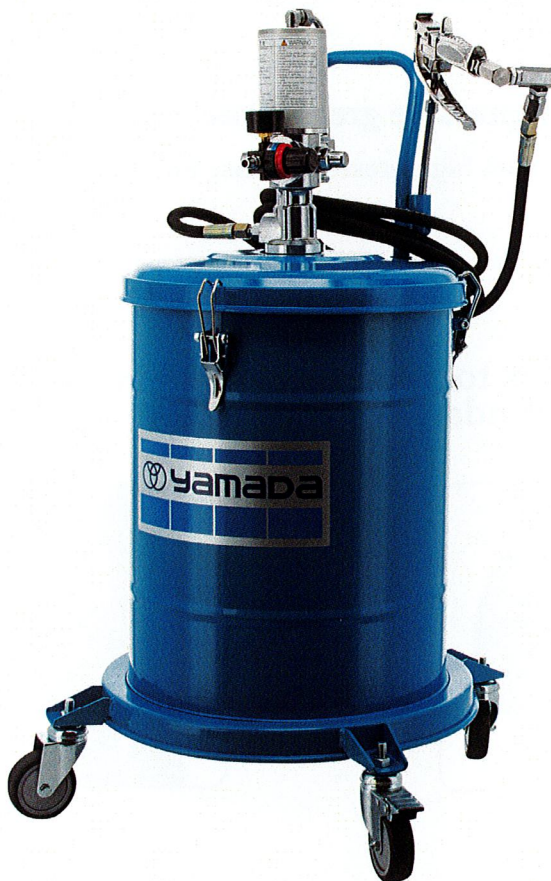
Model No. 687061

The new YAMADA operated grease lubricator "SKR-66C" has been put on market with new design and more features.