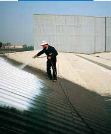
Spraying Aquaflex onto corrugated asbestos cement after treating with Malech