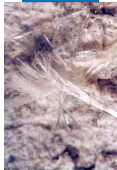
A microscope view of asbestos cement