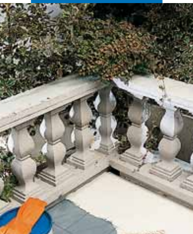
Using a roller to apply Aquaflex

space of time at a reasonable price. Buildings may also remain open while work is being carried out and application of the cycle, carried out by specialised contractors, is very simple. Also, with an encapsulation system, there is no toxic waste and risks to workers and the environment is reduced to a minimum.