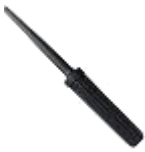
Probe Adjust Tool