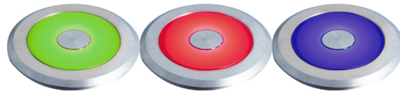
Flush Illuminated Vandal Resistant Switch - Metal Silhouette-Ring