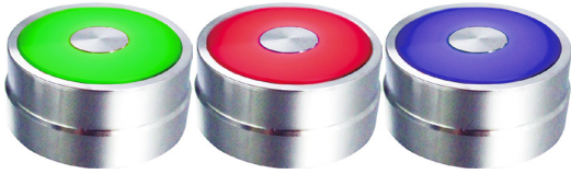
Flush Illuminated Vandal Resistant Switch - Metal Bezel-Ring