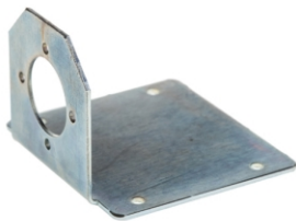
Pt. No. 727 Geared motor bracket (90 degree)

FOR ACCESSORIES TO FIT THIS SERIES GEARBOX, REFER TO 919D SERIES PAGE.