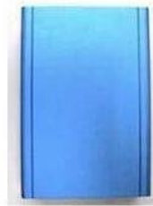
2. Extruded body