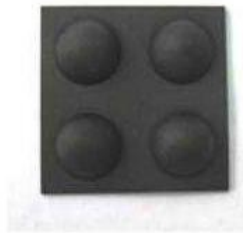
1. Rubber Feet (4pcs/sheet)