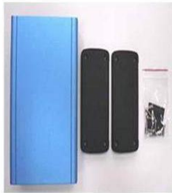
Body Panel Hardware Bag