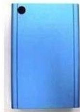
3. Per the photo, Affix the rubber feet in the extruded body.