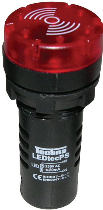
Representative of range